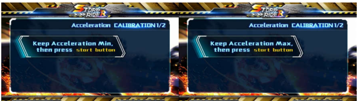
Pic 10Pic 11

Accelerator calibrate process are as follows (Pic 10 – Pic 12):