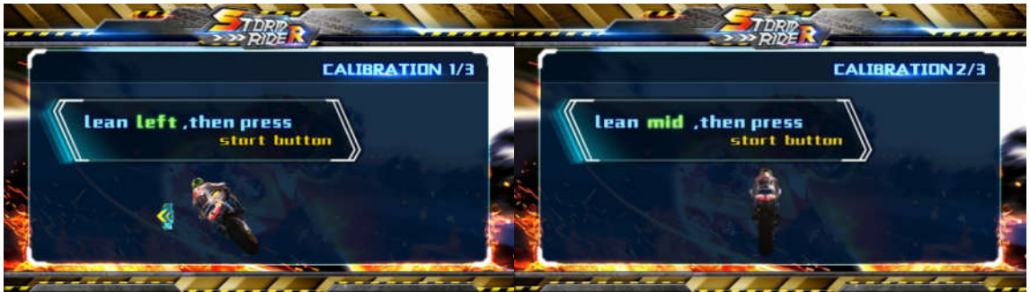
Pic 6Pic 7

Direction calibrate process are as follows (Pic 6 - Pic 9):