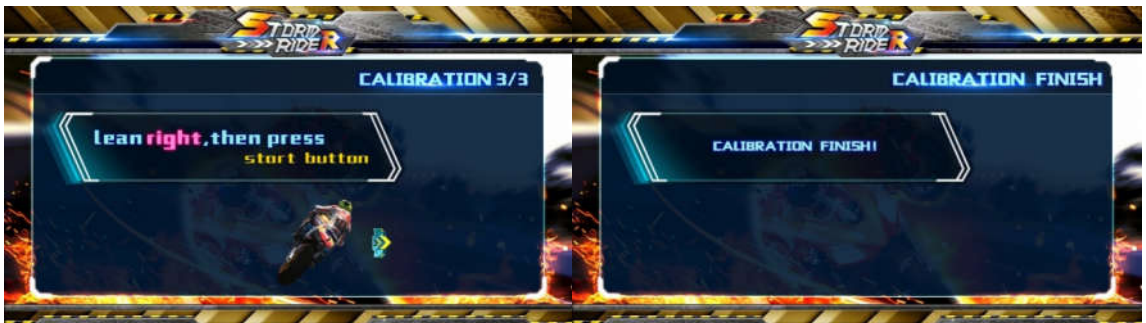
Pic 8Pic 9

Accelerator calibrate process are as follows (Pic 10 – Pic 12):